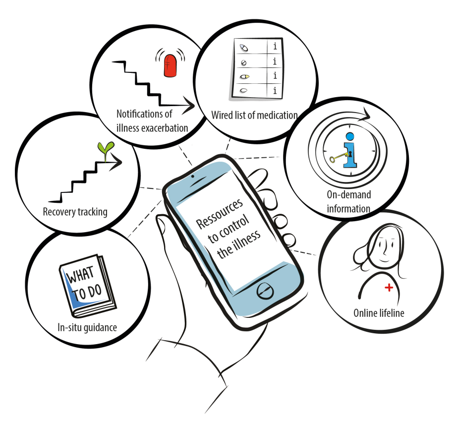
Figure 3. Synthesis of findings.

The findings presented here provide new insights into the users' perspectives on the needs of support when being young and recently diagnosed with schizophrenia, including potential features that should be considered in designing a smartphone technology to accommodate these needs. Our study highlights that a smartphone technology should be designed to promote empowerment while responding to the needs required to confidently navigate this new life situation.