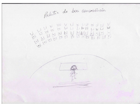
Figure 3. Patient's drawing number 3: Good acquaintanceship lecture.