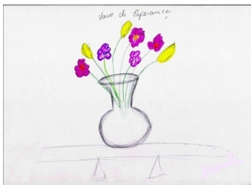
Figure 4. Patient's drawing number 4: Vase of hope.