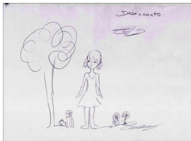
Figure 6. Patient's drawing number 1: Disenchantment.

It seems that through the drawings she got in touch with aspects of her healing self and saw that she was capable of dealing with the heart attack. Title: Solidity ( Figure 6 and Figure 7 )