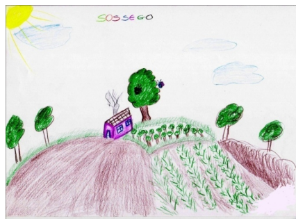
Figure 1. Patient’s drawing number 1: Peace.