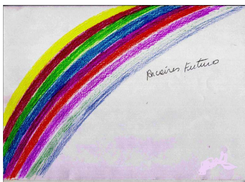
Figure 5. Patient's drawing number 5: Future rainbow.