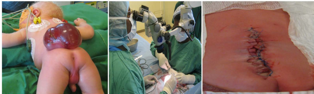
A radiculo meningocele of an albino baby operated using a microscope.