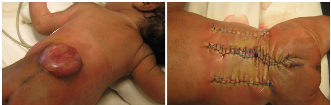
A large lumbar myelomeningocele operated with two lateral incisions to distend the skin.