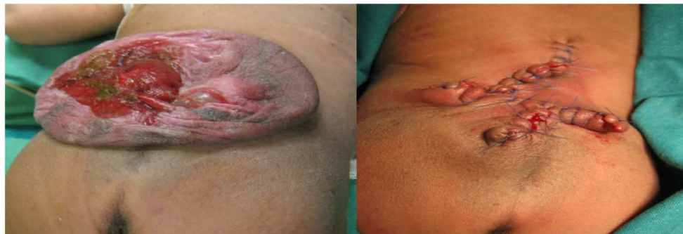
A lumbo-sacral myelo meningocele operated using H plasty technique for closure of the large defect.