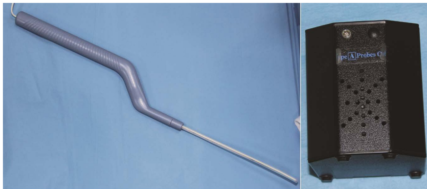
Figure 2. Micro-doppler probe.

had internal carotid artery injury (1.4%) and one of the patients had optic nerve injury (0.7%) in fluoroscopy group. CSF fistulas have stopped a few days after spinal drainage. First patient who had carotid injury is a 57-year-old male. The bleeding was mended via collagen sponge, abdominal fat, and tissue glue. ICA was seen intact in post-operative carotid angiography. Neurologic examination of patient was normal and tumor was controlled with stereotactic radiosurgery. Second patient who had carotid injury is a 40-year-old female during dural incision Left ICA hemorrhage occurred. The bleeding was mended via collagen sponge, abdominal fat, and tissue glue. Thinning of anterior wall in anterior folding of internal carotid artery was seen in postoperative cranial angiography. Defect was repaired with endovascular detachable coil. Neurologic examination of patient was normal and tumour was controlled with stereotactic radiosurgery. A 54-year-old man in fluoroscopy group had left optic nerve injury during removal of sphenoid septum. The patient had left eye vision loss postoperatively.