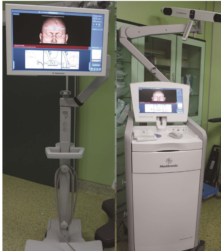
Figure 1. Neuronavigation system.