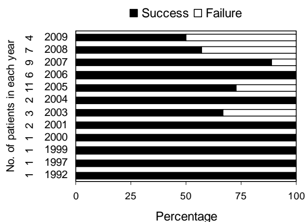
Figure 3. Proportion of V5-treated patients at study conclusion with negative (success) or positive (failure) sputum smear in relation to the year of TB diagnosis (Y axis).

As new TB drugs are still in pipeline, one of priorities in TB management is to find optimal combination among