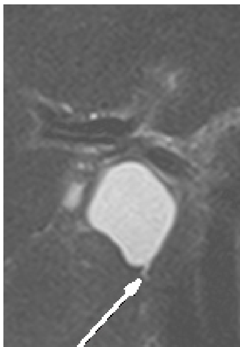
Figure 3. Magnetic resonance cholangiogram showed huge dilated common bile duct with abrupt narrowing distal bile duct (long arrow).