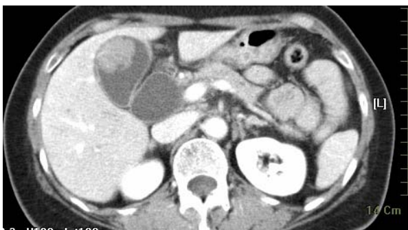
Figure 2. Abdominal scan showed polypoid mass of gallbladder (arrow) with dilated common bile duct.