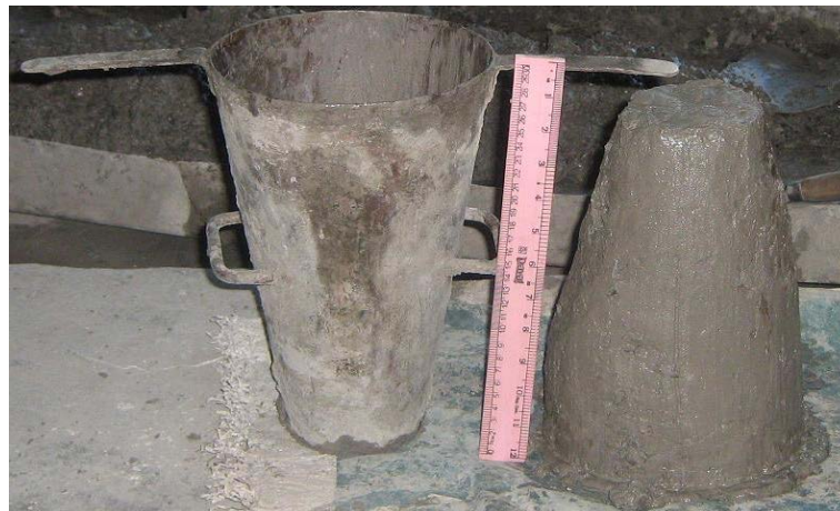
Figure 2. 25 mm slump concrete with 27% fly ash.

slump of concrete with 27% fly ash as replacement of sand.