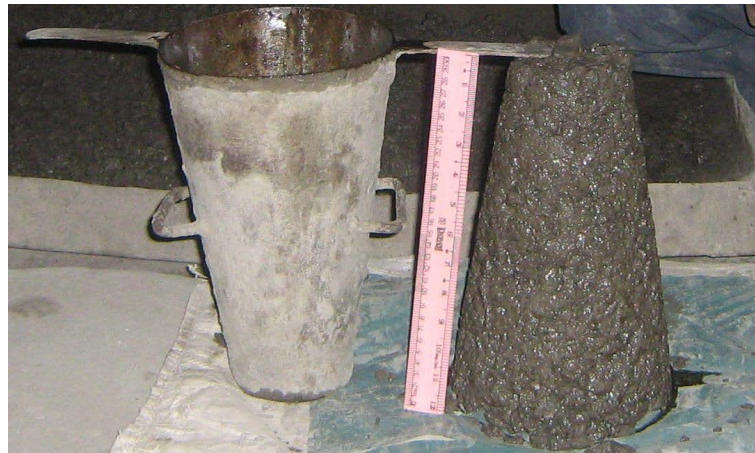
Figure 1. No slump concrete without fly ash.