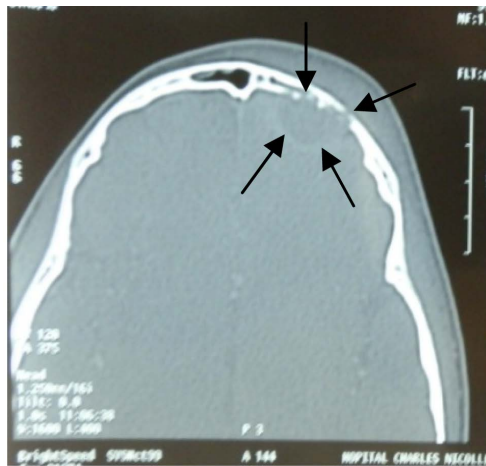
Figure 2. (Axial CT): Frontal osteitis with subdural empyema.