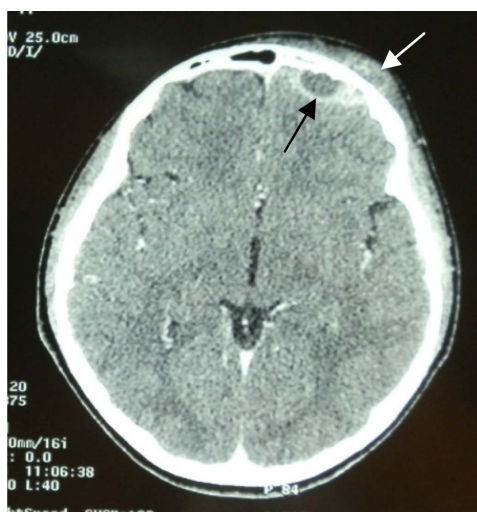
Figure 6. (Axial CT): Extradural empyema of the frontal lobe with Pott's puffy tumor.