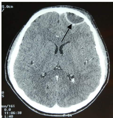
Figure 4. (Axial CT): Extradural empyema of the frontal lobe.