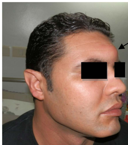
Figure 1. Frontal tumefaction.