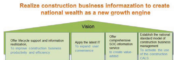
Figure 3. Expected Vision and Goal of Construction CALS

⑤ Use and promote the construction CALS : Organize construction business management systems to spread them as national standard models to local governments, etc., and to respond to additional standardization demand.