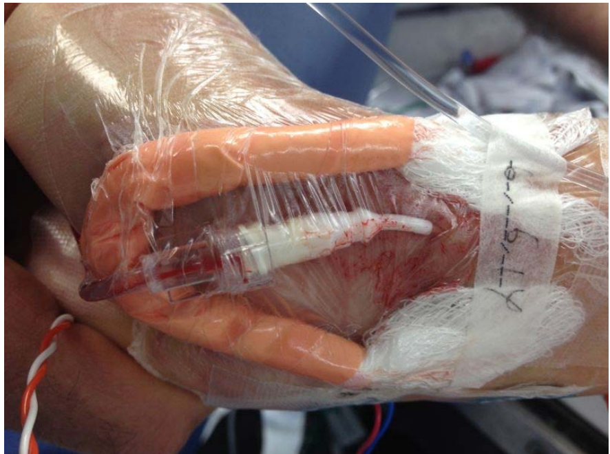
Figure 1. Anterior view shows how the arterial catheter stabilizer secures the arterial catheter and provides easy inspection of the site.

Based on our clinical experience, the authors believe that maintaining the radial arterial catheter at the same angle of insertion reduces the chances of the catheter kinking leading to stasis and thrombosis. In order to accomplish this, a 4 × 4 inch piece of gauze is rolled up and held taut at the corners diagonally. Hy-tape™ adhesive tape is then tightly wrapped around the piece of gauze. This taped gauze is bent into in a horse-shoe shape and placed on the wrist with the opening of the arterial catheter facing proximally and the arterial line resting over the closed end distally. A large Tegaderm™ Film (Model Number 1626W) 10 cm by 12 cm is then placed over the arterial catheter stabilizer. This allows for both the radial arterial line to rest at an angle similar to one at which it was initially inserted and easy inspection. In addition, it restricts the movement of the arterial line during flexion of the wrist especially during obtaining motor evoked potentials. The apparatus is shown in Figure 1 and Figure 2 . This arterial catheter stabilizer has been successfully used in neurosurgical cases in which motor evoked potentials of the hands were tested without any immobilization of the wrist.