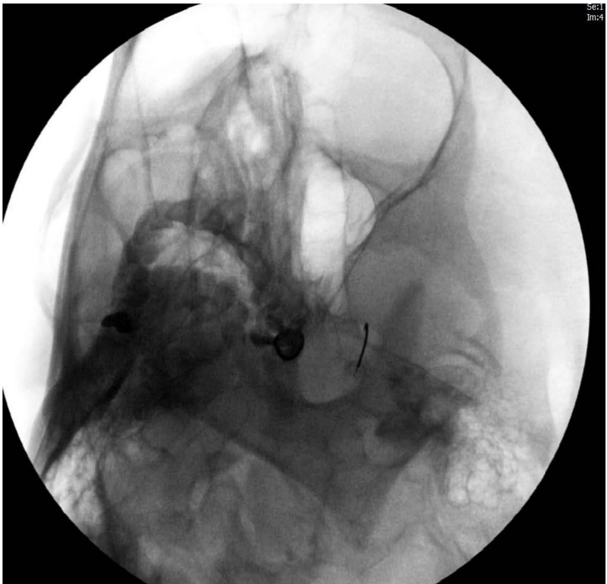
Figure 1. Left foramen ovale entry during pulsed radiofrequency [3].

Given the patients severity of pain on the initial presentation a sphenopalatine block using a nasal applicator was used for immediate 40% relief for 2 days. He was at that time referred to the pain psychologist for cognitive biofeedback and to the acupuncturist. Over the next 14 months the patient underwent 2 left gasserian ganglion blocks with short term 2 month 80% relief. Finally, pulsed radiofrequency [2] of the left gasserian ganglion Figure 1 & Figure 2 utilizing fluoroscopy with 75% relief for the next 12 months. During the time of injections and afterwards he continued care with the pain psychologist and acupuncture. His average numerical rating scale on pain diary 4.2/10.