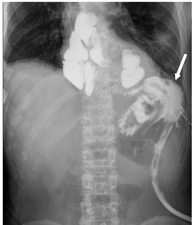
Figure 1. Contrast media leakage in left subdiaphragmatic region (arrow).

mentation at 50%, heart rate 80 bpm, mean arterial pressure 85 mmHg, peripheral oxygen saturation 100%, respiratory rate 18 acts per min). No complications occurred during the endoscopy execution, and procedure resulted negative for perforation.