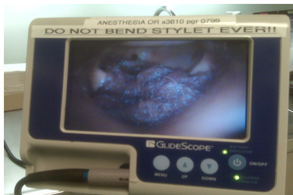
Figure 1. Our simulated airway on the GlideScope® screen. Visible is the large artificial blood clot. The glottis opening is visible as a dark circle above the blood clot. On the upper edge of the screen one can see a part of the epiglottis.

The AirSim Bronchi® intubation simulation model (TruCorp Limited Belfast, UK) was used. To simulate a difficult airway we injected artificial blood through a soft suction tube which was inserted nasally into the pharynx. The artificial blood was created in our simulation laboratory by combining normal saline and red food dye to a very dark red liquid. Clear surgical lubrication gel was then added to this liquid to obtain the viscosity of real blood. This artificial blood had the color, transparency, and viscosity of real partially clotted blood. Additionally, to simulate coagulated blood, we soaked a gauze pad (4 × 4 Kendall Curity gauze sponge 12-Ply USP type VII gauze, Tyco Healthcare) in the artificial blood after cutting it in half and inserted it into the manikin's airway with the help of the GlideScope® and Magill forceps, so that it came into position right above the glottis, covering about 50% to 70% of the view onto the glottis. This was done by the same person each time to ensure the same conditions for each procedure. This person was not a participant in the study. Furthermore we restricted the neck extension of the model mechanically to simulate situations such as cervical spine immobilization via in-line stabilization. Figure 1 shows our simulated airway seen on the GS screen. For direct visual laryngoscopy a