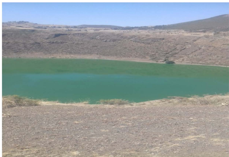
Figure 2. Lake Arenguade.

From household (HH) living in Gerbicha and Labusu buqa districts near the lake, 50 HH were selected purposively from each district around lake Arenguade