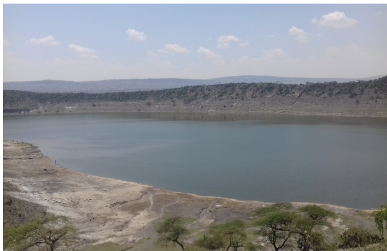
Figure 1. Lake Chitu.

Lake Chitu and Arenguade were selected based on the availability of Spirulina . Lake Chitu ( Figure 1 ) is a volcanic explosion crater lake which is located 287 km South of Addis Ababa in West Arsi zone, Aje district of Labu Subuqa district. Lake Chitu is situated at 25 km from Shashamane town with latitude 7°24'26"N,