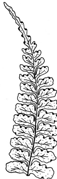
Figure 2. Dennstaedtia rectangularis : pinnule detail ( W. Burger & R. Stolze 5273 (CR)).

6) Additional revised material: COSTA RICA. San José: Vásquez de Coronado, La Hondura, 1400 m, 20 Jul 1927, M. Valerio 173 "32802" (CR).