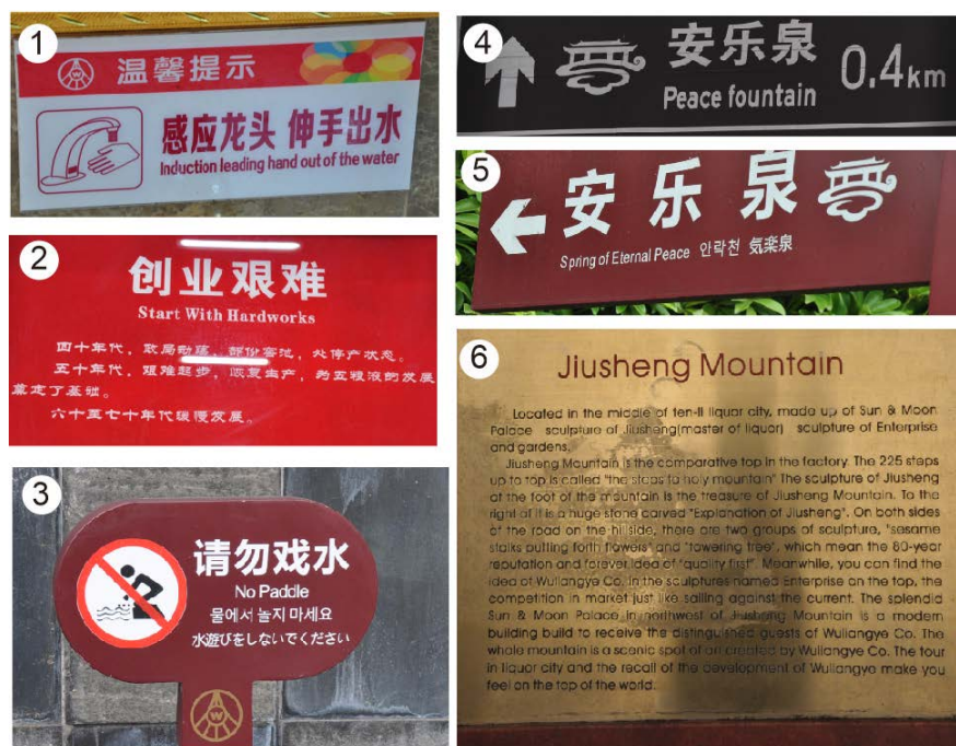
Figure 1. Examples of error or flaws in the English translation of public signs at Wuliangye Ten-mile liquor city.