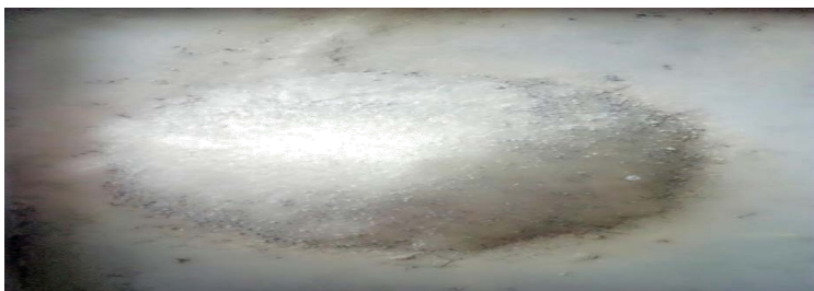
Figure 7. Quarry mud.