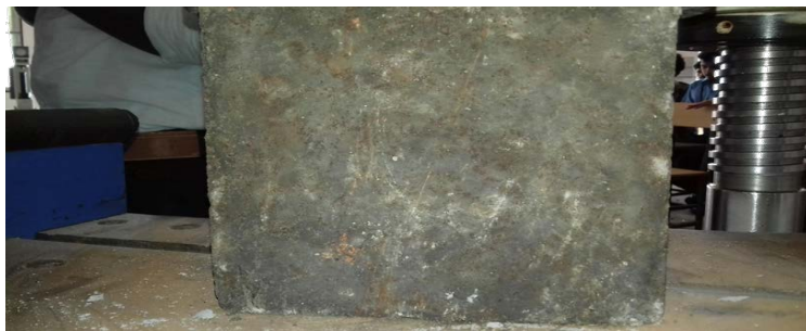
Figure 5. Compressive strength test for 14 days curing.