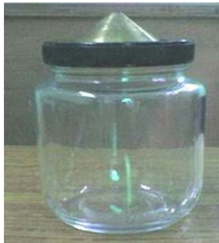
Figure 1. Pycnometer.