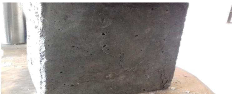
Figure 6. Compressive strength test for 21 days curing.