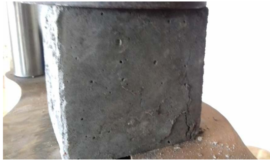
Figure 4. Compressive strength test for 3 days curing.