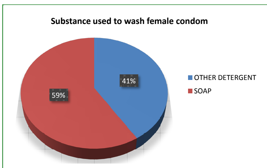
Figure 2. Substance used to wash female condom before reuse.

In this part of the work we will present our results and compare them to those of others.