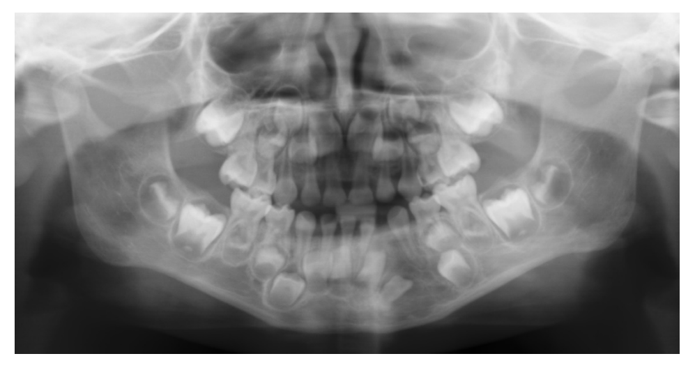
Figure 5. Panoramic radiograph taken 5 months after surgical procedure showing bone tissue neoformation.