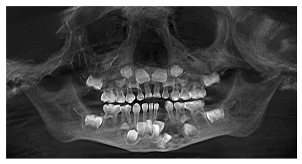
Figure 2. Cone beam CT exam, panoramic view.

Figure 1. Panoramic radiograph. First exam taken to the patient where the finding of the lesion is made. It shows a multilocular radiolucent lesion that produces displacement of tooth buds and compromises alveolar bone ridges until the inferior border of the mandible.