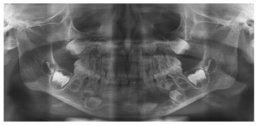
Figure 1. Panoramic radiograph. First exam taken to the patient where the finding of the lesion is made. It shows a multilocular radiolucent lesion that produces displacement of tooth buds and compromises alveolar bone ridges until the inferior border of the mandible.