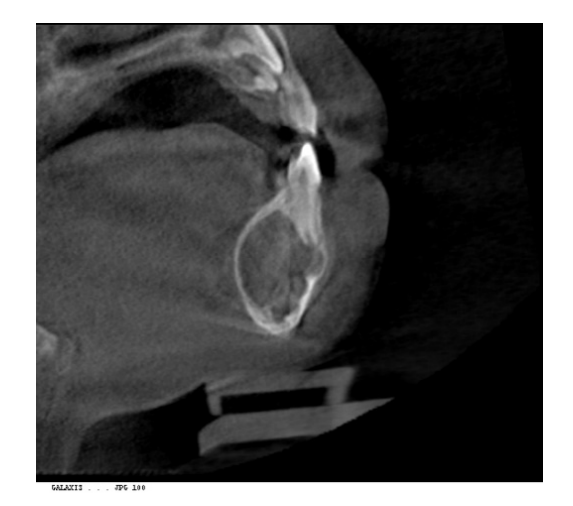
Figure 3. Cone beam CT exam, sagital view.