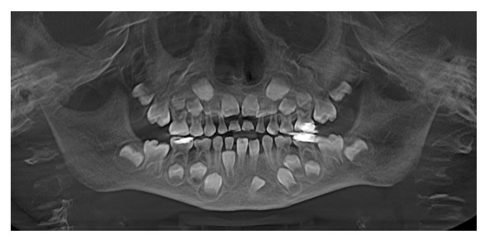
Figure 6. Cone beam CT exam taken as follow-up 2 years after surgery.

Radiographic follow-up every 3 to 4 months through Panoramic radiograph is suggested to control potential recurrence.