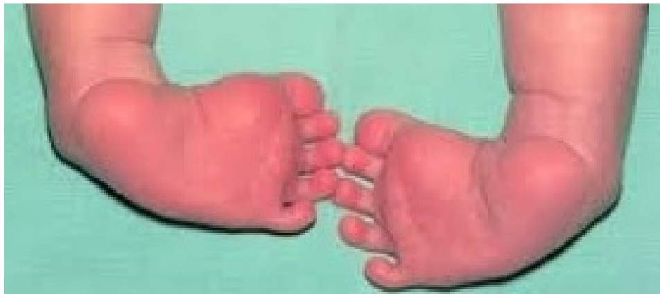
Figure 2. Photo of newborn diagnosed as bilateral clubfoot.