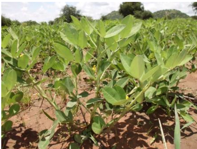
Figure 7. Arachis hypogea L.