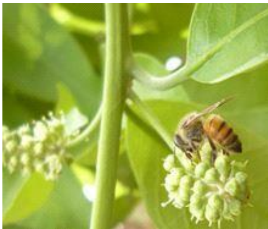
Figure 4. Combretum collinum Fresen.