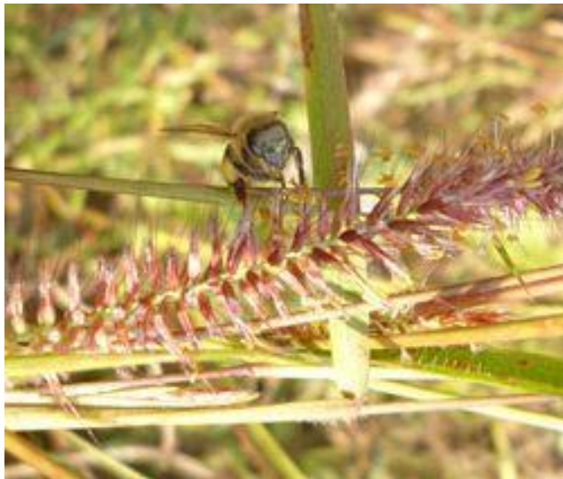
Figure 6. Pennisetum glaucum (L.) R. Br.