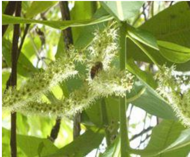
Figure 5. Terminalia schimperiana Hochst.