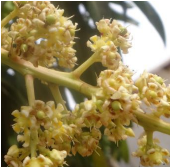
Figure 3. Mangifera indica L.