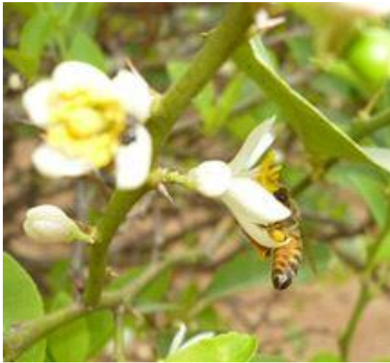
Figure 2. Citrus aurantifolia (Christm.) Swingle.