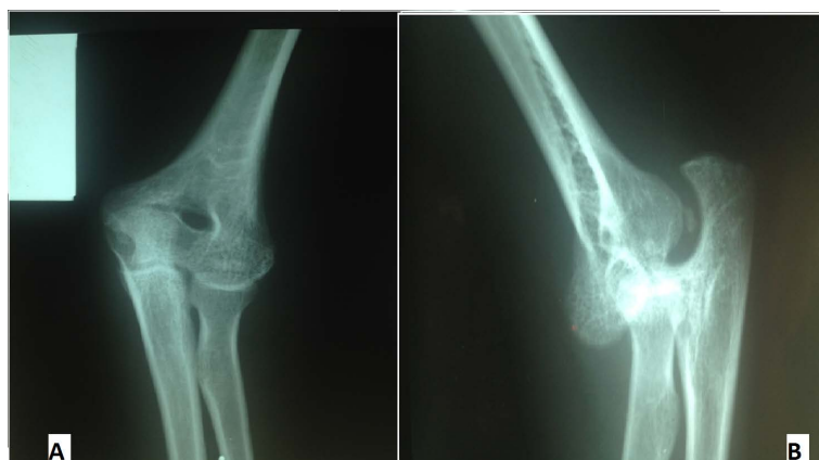
Figure 1. Face (A) and profile (B) X-ray showing a neglected dislocation of the elbow.

Neglected dislocations of the elbow considered rare in West are still frequent pathologies in developing countries. The delay of management of patients is often due to the initial recourse to traditional quacks [1]. These bonesetters use massages with forced manipulations and immobilization in extension which not only delays the diagnosis and the treatment, but also led to complications [7].