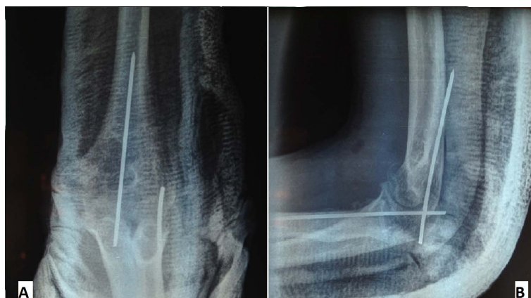
Figure 3. Postoperative X-ray control face (A) and profile (B) of a double k-wiring humero-radial and humero-ulnar.

Speed [8] and Cambell [9] reported the first studies led on this affection. Martini [10] reported in 1984 a series of 47 cases of neglected dislocation, only 25 cases were operated, he recommends the abstention in front of a stiffness on the verge of the functional adaptation and which can improve under physiotherapy. He also introduced the notion of functional stiffness when flexion of the elbow was situated between 80° and 90° and the not functional stiffness when flexion does not exceed 70° not allowing to assure the useful movements.