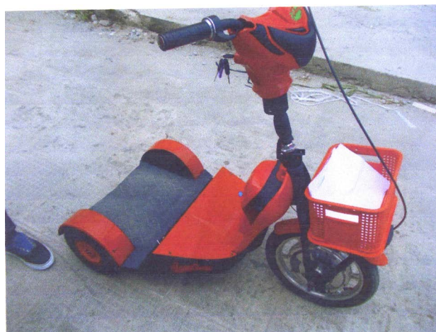
Figure 2. Picture of the finished project.