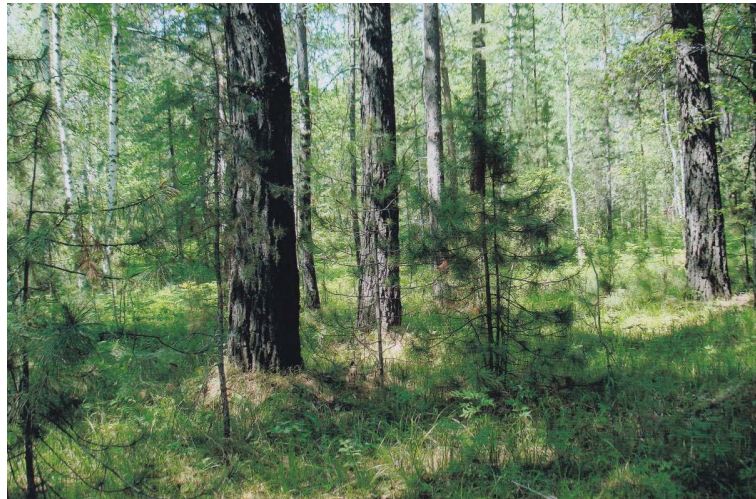
Figure 2. Formation of a stable layer (second one) of dark coniferous trees species ( Pinus sibirica , Abies sibirica , Picea abovata ) in the polydominant forests with light coniferous ( Pinus sylvestris )-parvifoliata ( Betula pendula , Populus tremula ) second growth with trend of increase of the role of taiga undershrubs ( Vaccinium myrtillus , Vaccinium vitis-idaea ) and mosses ( Dicranum polysetum , Polytrichum juniperium , Hylocomium splendens , Ptilium crista-castrensis ) in the soil cover everywhere.