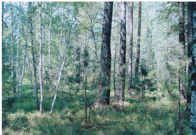
Figure 3. Polydominant light coniferous ( Pinus sylvestris )-parvifoliata ( Betula pendula , Populus tremula ) second growth forest with the dark coniferous young trees species ( Pinus sibirica , Abies sibirica ) in the first stage of the dark coniferous formatting for region.