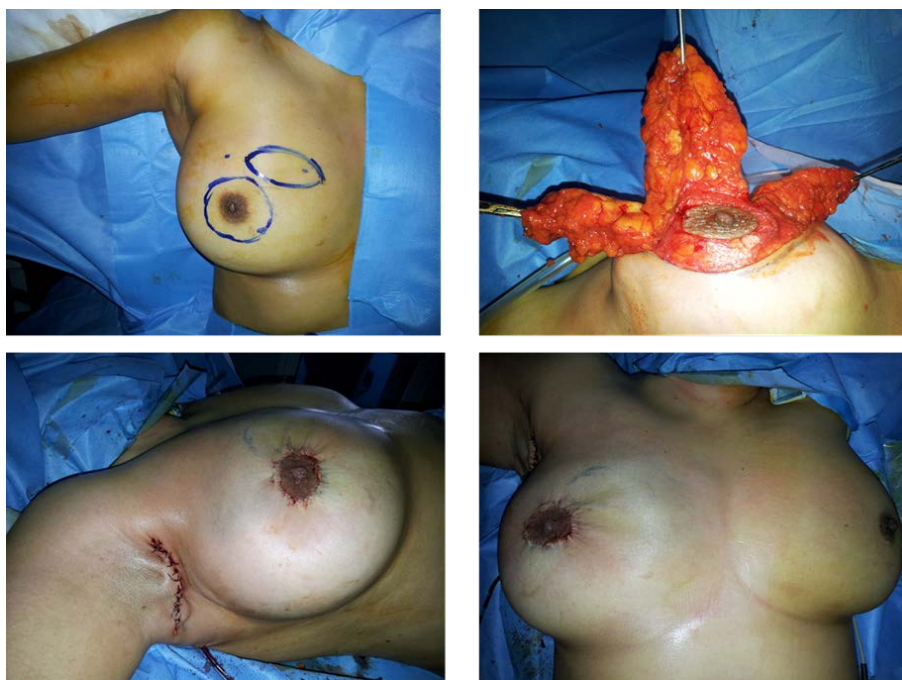
Figure 2. A 43-year-old woman with a palpable tumor at the upper medial quadrant of her right breast. An oncoplastic resection of 300 g was performed. Histology showed a ductal carcinoma and axillary lymph node status was 4/14. Immediate postoperative outcome is presented.

The morbidity would be between 15% and 30% [15]-[17], a little bit higher than the conventional conservative surgery is, estimated at approximately 10% [12] [16] [18]. In addition, main complications underlined in the literature after oncoplasty are healing disorders, abscesses, hematomas, cases of partial or complete nipple necrosis. In our series, the complication rate was 12.5%. The average hospital stay was 3.5 days, less than in the study of Staub (5.2 days), or of Giacalone (4 days). These complications may require further surgery in less than 5% of the cases, mainly in case of hematoma, nipple pain [17] [19]-[22]. In our study, the rate of reoperation was 4.1% and was mainly for nipple necrosis.