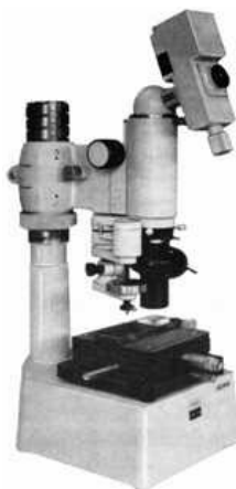
Figure 2. The image of the microhardness-testing machine PMT-3.