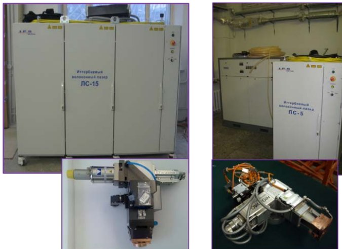
Figure 1. The image of the lasers LS-15 and LS-5, laser heads YW50 and HighYAG BIMO.