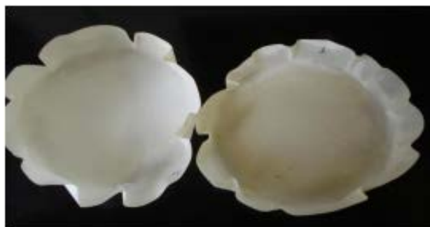
Figure 3. Filter paper before (left) and after (right) insoluble residues analysis for sample C4.

Although the standards of chemical quality analysis of sugar are observed singly, it is important to notice and analyze then considering their direct relation. This condition results in the interaction of the attributes, which are indispensable to characterize and evaluate sugar quality.