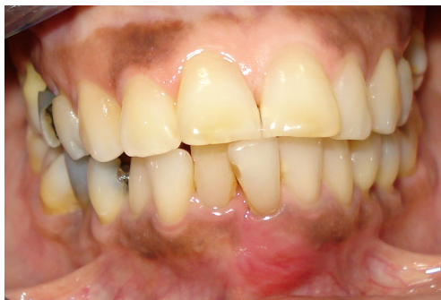
Figure 1. Anterior buccal view with a swelling near lower left central incisor.