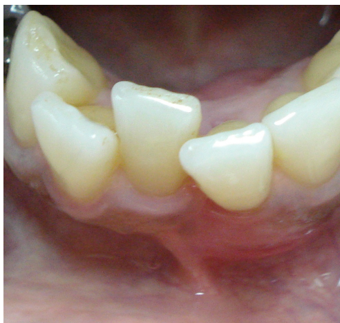
Figure 2. Occlusal view of lower anteriors.