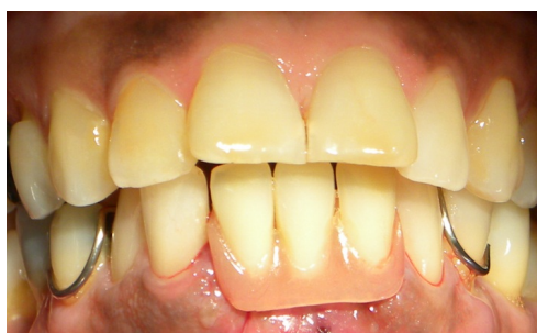
Figure 8. Anterior buccal view of VLC denture fitted.