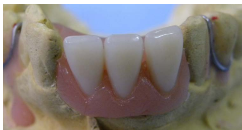
Figure 4. Anterior view of lower model with VLC denture.

At the three-month review, the tissues were found to be healing appropriately. The denture exhibited no signs of fracture and there appeared to be no decrease in the bond strength of the acrylic teeth to the denture base. The denture was relined at chair-side with hard denture reline material and it was proposed that monitoring for a further three (3) months be done while the patient accumulated sufficient funds to embark on a more definitive restoration for replacing the missing mandibular dentition. The patient was unable to afford definitive treatment for one year and as such maintained the denture for that period. Follow up after one year showed that the aesthetics, function and structural integrity of the denture had not been compromised ( Figure 9 ).