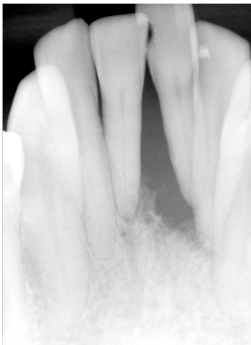
Figure 3. Periapical radiograph of lower anteriors.