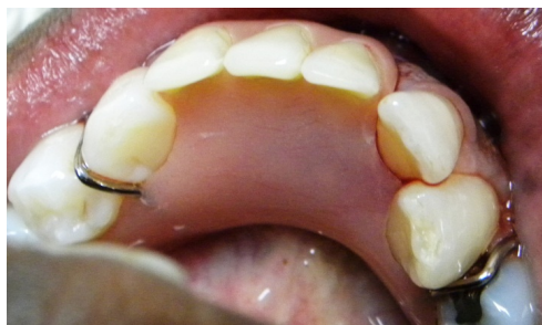
Figure 7. Lingual view of VLC denture fitted on patient after extractions.