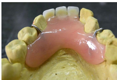
Figure 6. Lingual view of VLC denture trimmed and polished on model.