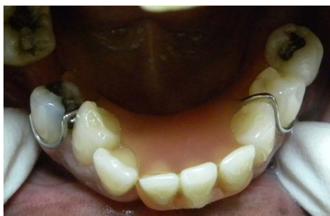
Figure 9. VLC denture after 1 year review.