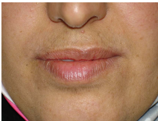
Figure 1. Patient with right-sided asymmetric upper lip at rest.