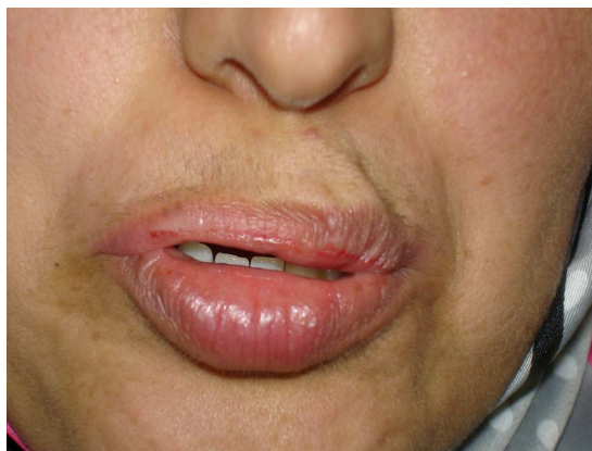
Figure 2. The upper lip is pulled toward the intact left side.