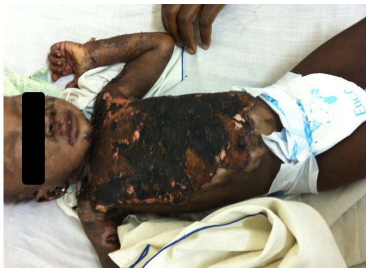
Figure 2. Month old child with burn injuries dressed with cow dung.

Adequate education of the general public about the dangers of burns and how to prevent burns will go a long way to reduce the burden of burn injuries. For example, people should be taught to take a bucket of cold water to the kitchen to mix the hot water in the kitchen rather than transporting hot steaming buckets of water to the bathroom. Similarly, the Ghanaian public should be encouraged to stand lit candles on non-combustible materials. In the use of LPG Cylinders safety precautions such as keeping the cylinders outside and passing the tube