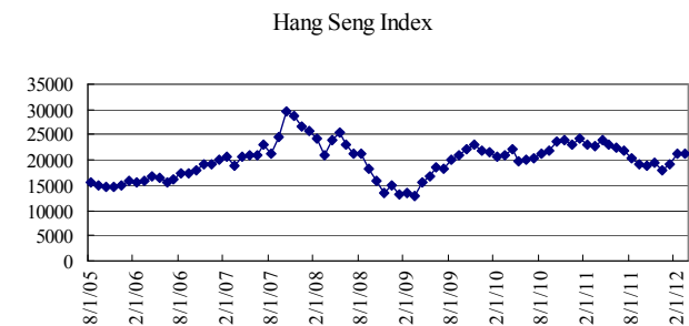
Figure 2. Hang Seng Index, August 2005-March 2012.