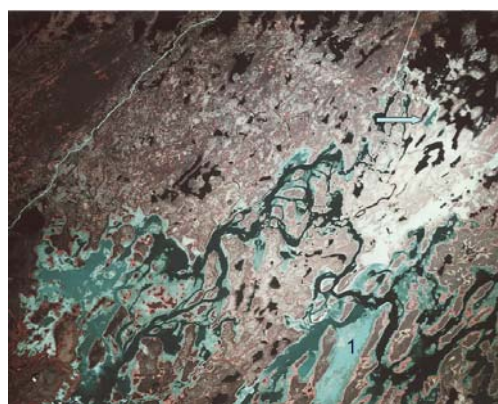
LEGEND Test Lake: → → → → Arrow De-watered area (Figure 1, Zone 1): 1

changes caused by the flooding. The development at Churchill Falls, Labrador, Canada presented an opportunity to investigate the effect of flooding in the Boreal northern temperate region. The papers I, II and III report on the results of short and long term research starting with the establishment of the Main Reservoir (Bajzak and Roberts [1,2]). Background information and the study of the natural re-establishment of vegetation in the vicinity of the main dyke system was a main goal of the research. The most visible changes occurred during the