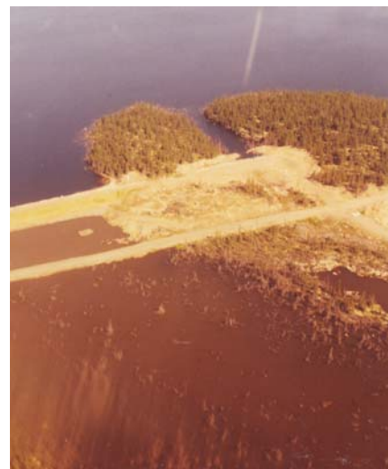
Figure 2. Flooded Pools (with flooded water killed trees).

Near the original shore line a dense mixture of Alder and Willow ( Salix pirifolia Anderss) thickets can be found (area at letter A ). Between this area and the water, muddy surfaces exist (at B). On the higher-drier parts various moss colonies ( Polytrichum and Bryum species) established soon after the de-watering. There is a continuous struggle existing here between the new vegetation cover and surface erosion. The area identified by letter C is composed of water-logged silt deposits covered by a thick layer of sedges ( Carex aquatilis , Carex saxatilis and Eriophorum opacum .) bordered by willows. The area at D is a narrow strip of large boulders with some Alder bushes growing in the hollows between the boulders. The shores of muddy materials (at E) are sparsely vegetated but later succeeded by Alder bush growth. The area at letter F is a very large gentle sloping mud flat composed of impermeable silty-clay and does not support any vegetation growth. Where the shore is steep (at G) a narrow area of large boulders is present,