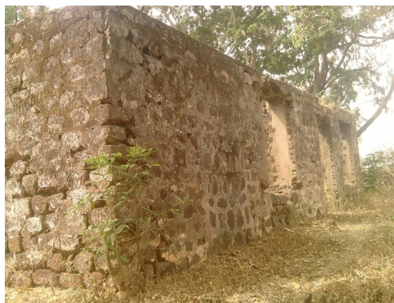
Plate 8. Lugard’s colonial two room rest house on Mount Patti.

GPS reading: N-07°26'15.7", E-007°24'41.11", Elevation—301.3 m; Door measurements: Length—2.2 m, breadth—1.1 m; Window measurement: Length—1.7 m, Width—1.3 m; Floor: length—4.3 m, width—4.3 m; Height of the building without roof: 2.3 m; Total length of the house: 8.6 m.