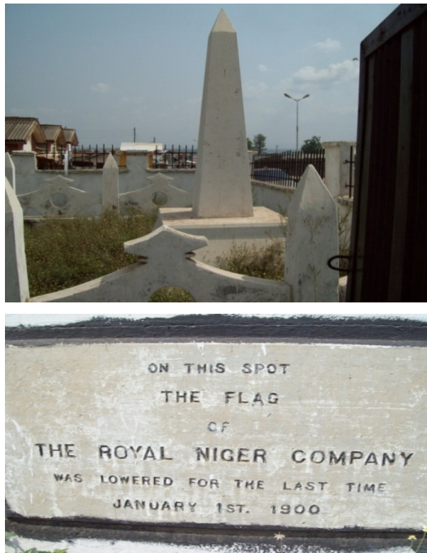
Plate 6. Concrete pillar of British Government—Lokoja, Karaworo area Lokoja.

The spot of the formal handing over of administration and control of Lokoja was marked with a concrete pillar measuring 2.5 m high. It was here that the royal Niger Company flag was lowered for the last time in Nigeria and the Union Jack of the British Government was hoisted.