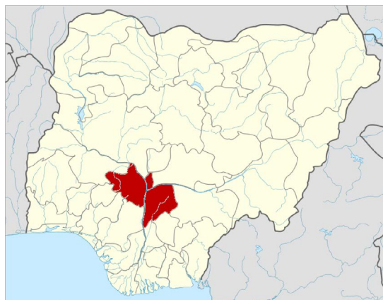
Figure 1. Map of Nigeria showing Kogi State.

Lokoja is a city in Nigeria ( Figure 1 ). It lies at the confluence of the Niger and Benue rivers. It is the 4th biggest city in Kogi and is the capital of Kogi State ( Figure 2 ). The straight distance between Lokoja and Abuja is 101 miles (162 kilometres). The city accommodates a population of 60,579. Weather records are as follows: Temperature is 85° F (29° C), Wind Speed at 4 mph (6 km/h) and 67% Humidity. Latitude is 7° 47' 48.77" N while Longitude is 6° 44' 25.73" E [7] with an altitude 45 to 125 metres above sea level. It is situated on the western bank of the River Niger close to its confluence with River Benue and sandwiched between the River and the Mount Patti [8].