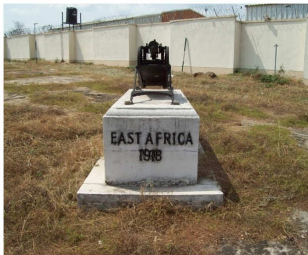
Plate 4. Artillery used 1918.