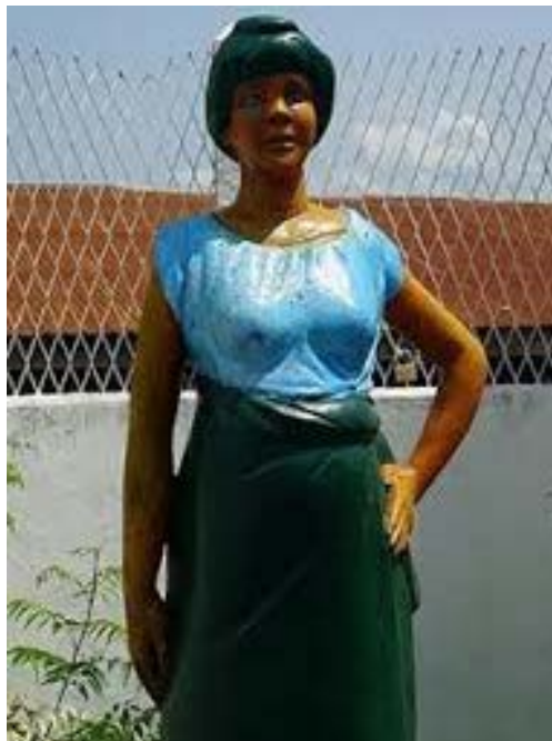
Plate 1. Princess Inikpi of the Igala people.