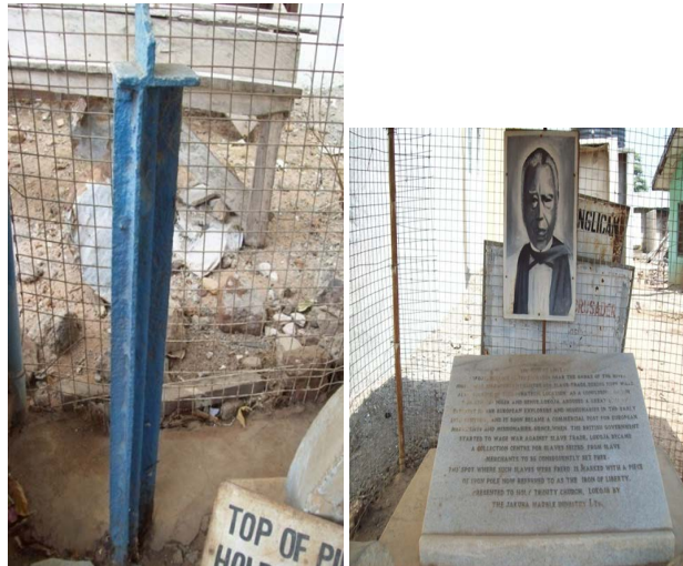
Plate 2. Iron of Liberty and the write up enclosed with the Iron of Liberty.