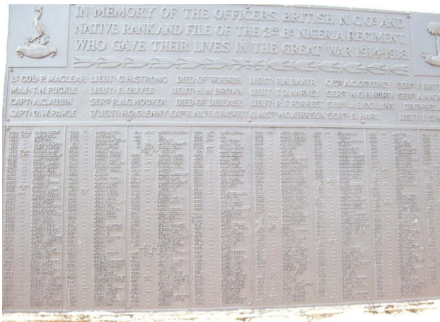
Plate 3. Officers of Nigeria regiment in 1914-1918 World War 1 inscribed on a plaque on the Cenotaph.