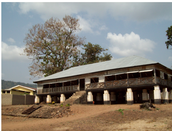
Plate 7. Kogi state tourism board accommodation.

Cultural attractions such as the Akodi African Centre and Colourful cultural festivals or events. There are about 31 cultural festivals in Kogi State.