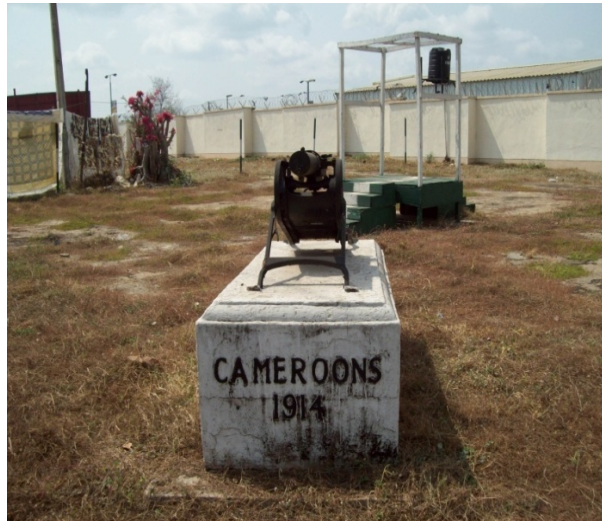
Plate 5. Artillery used in Cameroon in 1914. Source: field survey.