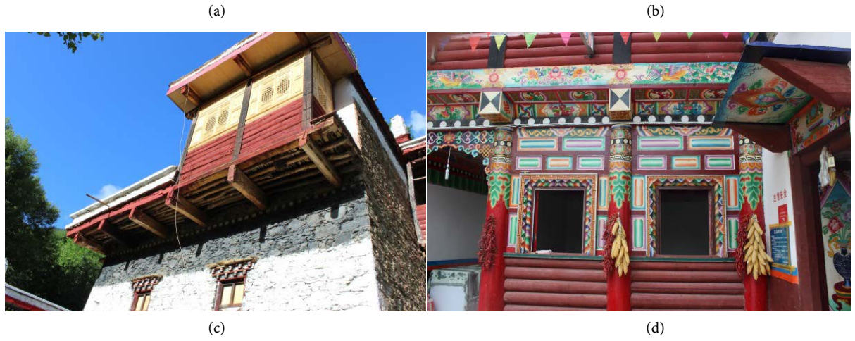
Figure 3. Traditional elements in houses. (a) Ribbons on the wall; (b) White stones on the top; (c) Traditional materials and colors; (d) Traditional decorations.

visitors to walk. Thus residents started to use cement on the balcony and roof, and also concrete, panels and other modern building materials to meet the needs of the tourists. Thirdly, the villagers also generally installed solar water heaters and the network wires in the additional buildings.