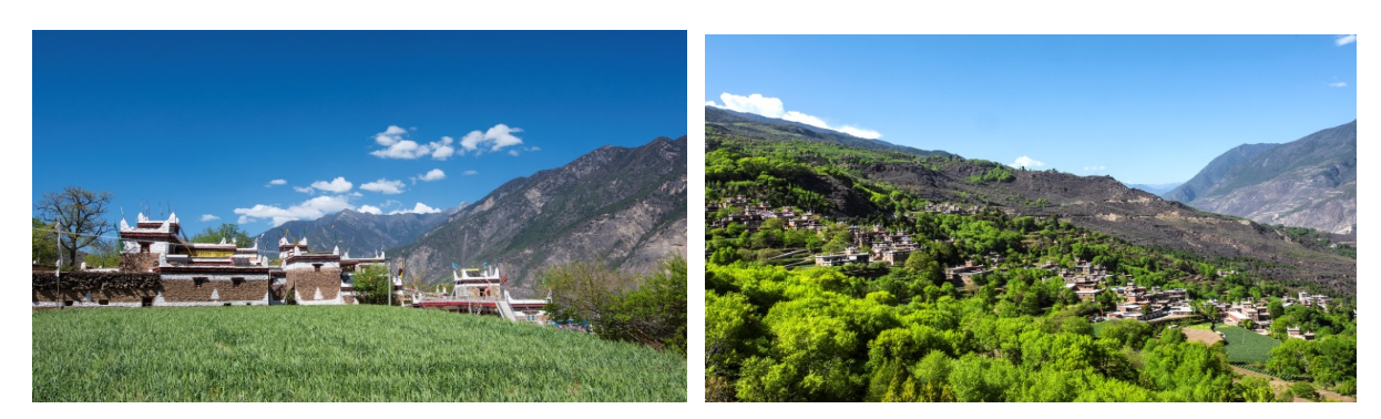
Figure 1. Photos of Jiaju Tibetan Village, 2017.

Destination branding process involves many stakeholders, such as local residents, investors, employees, students, retirees, tourists, media and public opinion leaders, entrepreneurs, services, foreign leaders and export buyers, etc. (Gilmore, 2002) [15]. Destination branding is usually a top-down process. The core stakeholders in the process of destination branding include local residents (including tourism practitioners and local social members), entrepreneurs and visitors ( Figure 1 ) (García, Gómez and Molina, 2012) [16]. Local residents contribute to the destination branding, for they directly contact with tourists, and help to choose or recommend products to tourists (Freire, 2009) [17]. In one study of the Japanese Hiroshima tourism, Chuntao, Caroline and Yoshitsugu (2014) points out that local residents led the renovation of Hiroshima city to meet the tourists' requirements, and local residents are the backbone of reshaping