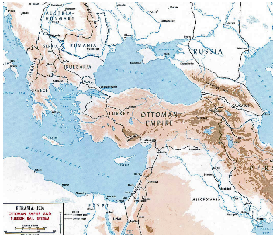
Figure 1. Map of Ottoman Empire in 1914

diversity of cultures country. This is partially due to a huge amount of enlargement they carried out during the middle ages periods. According base on the latest United Nations estimates in March 2017, the current population of Turkey is 80,181,553 (Worldometers, 2017). One of the demographic issues of Turkey to against to access to the EU is the current immigrant crisis of Syrian refugee that is the neighbors country of Turkey. Migrant crisis makes Europe facing large of the problem. As a result of Syrian refugees, issues make European public view against Turkey and extend Turkey's EU member hold in the process. According to United Nations estimates, Syrian refugee's population in the country was more than over 2.8 million as a beginning of January 2017, that have crossed since 2011 after the start of the Syrian Civil War. As a result of the war, make large of Syrian number escaped to the neighbor country like Turkey. Nowadays, Turkey has now become the world biggest for Syrian refugee country (Burak Kocamis, 2016) and hosted more than 2.8 million, and this will be one of the demographic changing for Turkey in the future if accepted Turkey to be a member and this one of the biggest obstacle for Turkey in demographic debates.