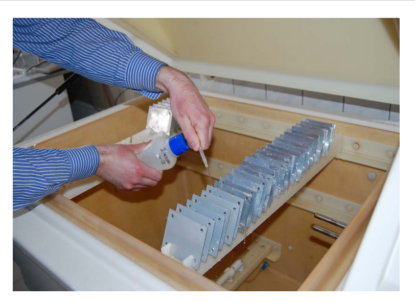
Figure 1. Samples inside salt spray chamber.

technique used for the detection of trace elements. It works on basic principle that the samples at high temperature plasma up to 8000 Kelvin converted to free, excited, or ionized ions. The excited atoms emit radiations when it goes back to ground state. Detectors optically measure the emitted characteristics radiation and intensity [10]. The sample preparation is most important technique that to be considered before any elemental analysis because the solution before test must be free from any impurities to avoid error in detection of elements. To predict behaviour of TCC coating in corrosive liquid the coated sample was immersed in 0.85 M of NaCl solution for three days in closed condition. The NaCl solution was prepared form nano pure water supplied by VMR International Kft [11]. The elements inside corrosive liquid from trivalent chromium coating and its substrates is analysed by ICP-OES at department of chemistry in University of Miskolc.