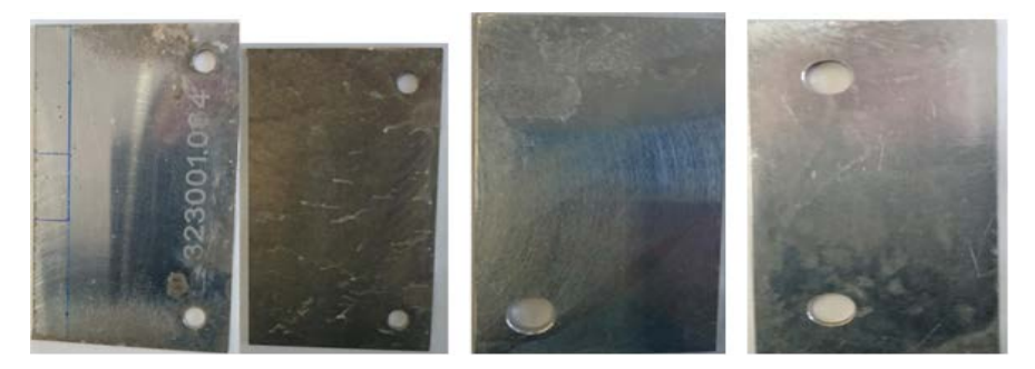
Figure 6. Result of untreated and treated AA6063 alloy with various coating mass (0.15 \text{ g/m}^2) left and (0.3 \text{ g/m}^2) right.

under which coating is dried for certain period to achieve stabilized structure. Post water treatment is a technique in which freshly coated layer is immersed immediately after sample preparation in to water for few seconds to obtain optimized coating state [17]. The corresponding experimental results will be discussed in our next paper using SNMS technique [18].