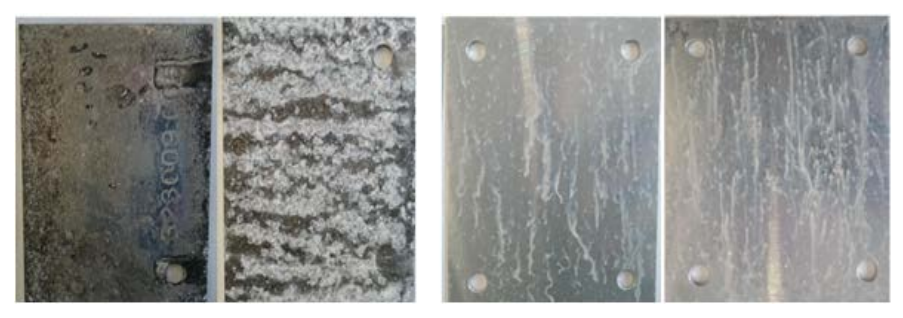
Figure 4. Result of untreated and treated AA7075 alloy with various coating mass (0.16 \text{ g/m}^2) left and (0.36 \text{ g/m}^2) right.