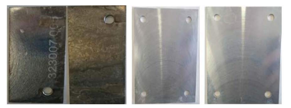
Figure 5. Result of untreated and treated AA6082 alloy with various coating mass (0.12 g/m^2 ) left and (0.46 g/m^2 ) right.