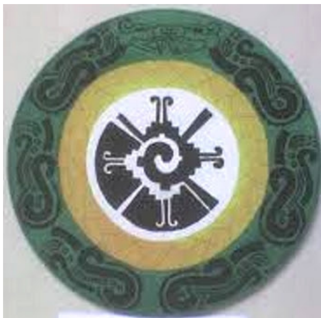
Figure 1. The toltec universe [9].

5) The Roman Empire inherited the Greek culture, including the Pantheon of Gods. However, both Romans and Greeks had a common adoption (II a. C), the Iranian deity Mithras, who was assumed to be the creator of the Universe; that belief began to decline at the time of Constantine [8].