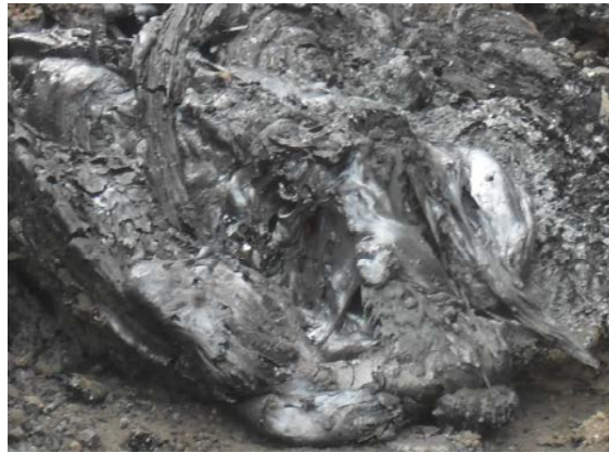
Fig. 1: Typical image of ferrous slag.

slag. The data obtained from grain size distribution curves is used in the design of filters for earth dams and to determine suitability of slag for road construction [14].