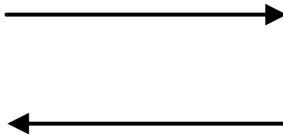
Figure 1. Three send & three lead.

Innovative talents. Thick ability of production, education, R&D is powerful support. The high end of subjects and huge industry vision let kinds of talents come to BGI, also, BGI is willing to give a post to these talents only if he is talented. Many employees are still looks like students and it is them that create the miracle of BGI [12]. In 2013, BGI published 196 papers on SCI, 12 on Nature, 3 on Nature side. The young employees are the main propulsion. In addition, there are also some “big fishes” in industry will come to BGI work without salary [13].