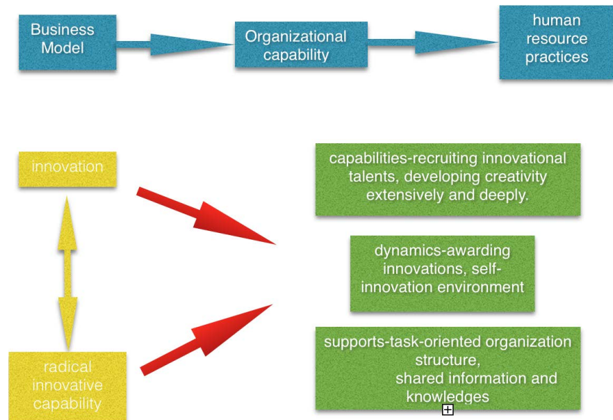
Figure 3. Summary maps about human resource of radical innovational cooperations.

formed production, the integration of the entities, enterprises and the organization system [17]. Two platforms based on the experiment and calculation, to perfect science and technology, links, industry and the support system, respectively, set up the BGI R&D, BGI technology service Ltd., BGI health technology Ltd., BGI institute etc.