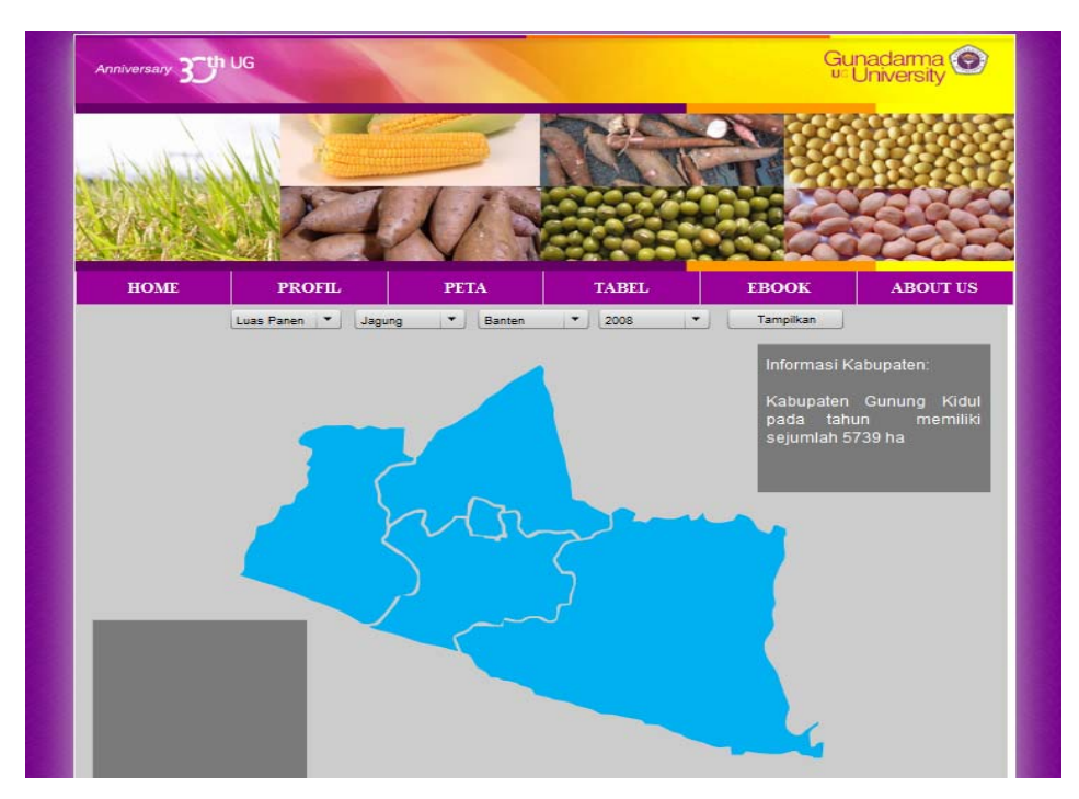
Figure 2. Plan of prime display.