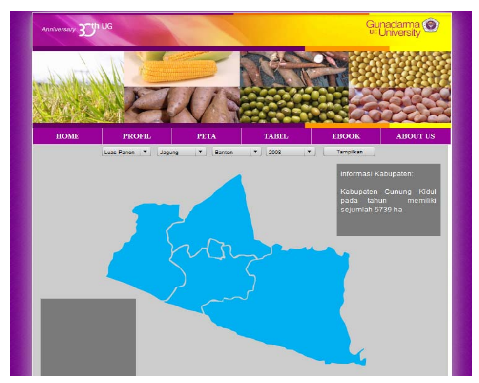
Figure 3. Profile design.

On the map page, there is Default Java Island with 6 Province. Moreover user show data mapping based on chosen of indicator category, Plant, Region, and year. Provided information is data each regency in transparent gray for specific area which automatically works, it is