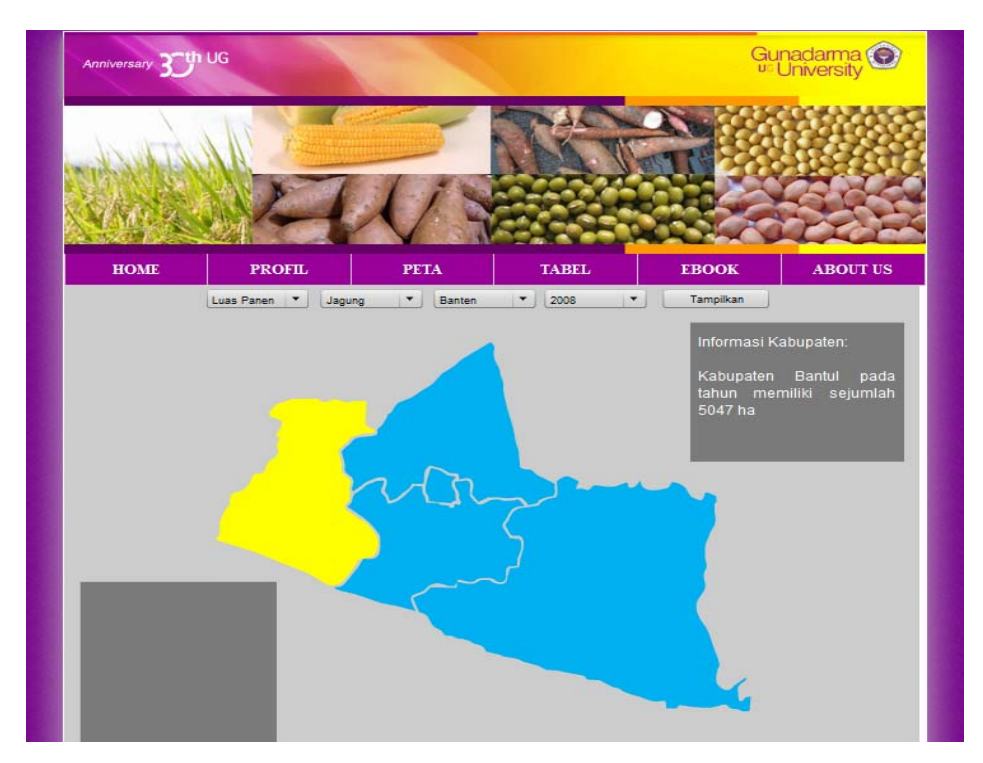
Figure 4. Yogyakarta map, Bantul regency.

This table shows data information of each regency based on chosen of indicator category, plant, area e.g. Yogyakarta, with production indicator, maize plant, in 2008, 2009 and 2010.