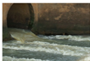
Site of Bridge of Koroborou in August 2016 (PKO)