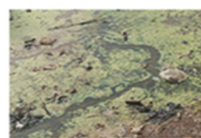
Site of Ibicus School in March 2016