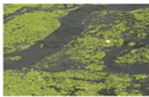
Site of Mosque Sinangourou in April 2016