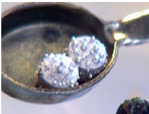
Figure 1. Heated copper amalgam pellets with mercury released, ready for trituration using a glass mortar and pestle.

Description of Mercury use. Copper amalgam, 70% mercury to 30% copper, was supplied in pellet form. Pellets required heating over a flame to soften the copper and release the mercury so the amalgam could be mixed (see Figure 1 ).