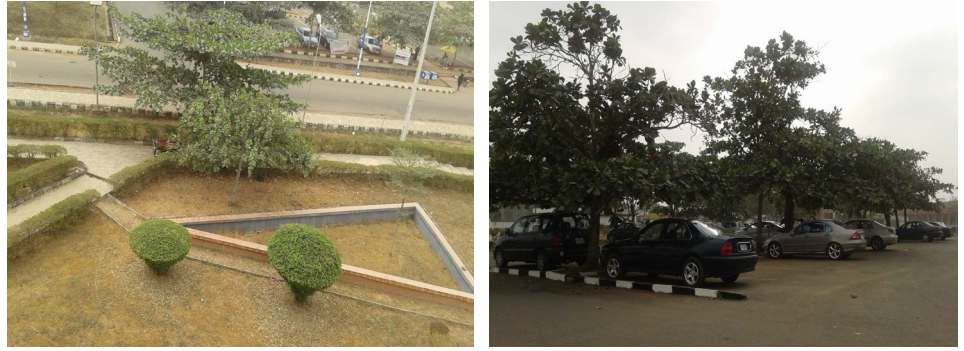
Plate 2. Landscape elements.

and planning of the institution. Plant materials of different kinds (color) should be adopted in landscaping of the campus environment in order to improve the aesthetic value.