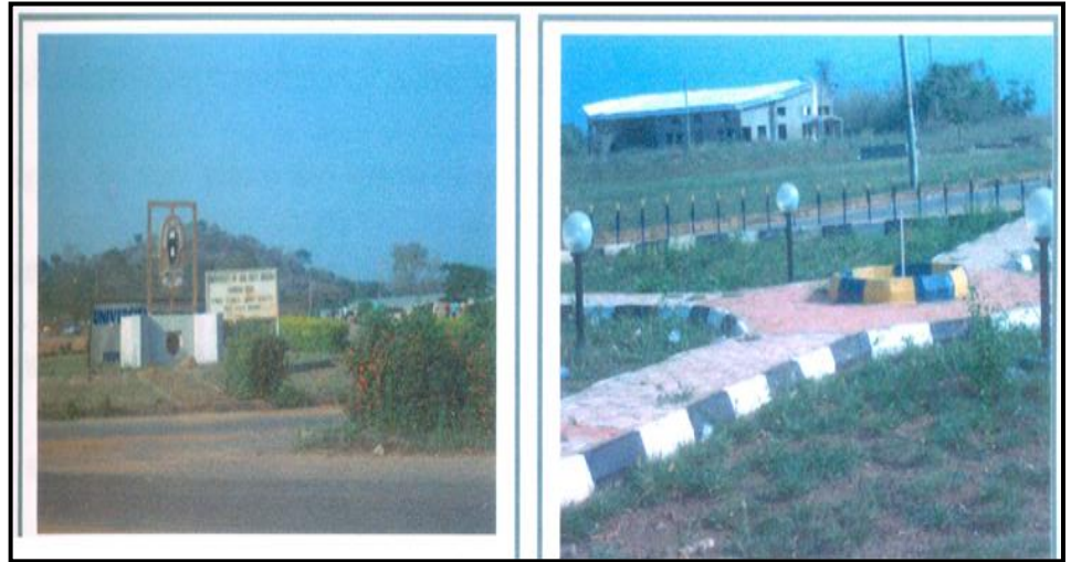
Plate 1. Existing landscape pattern of EKSU.