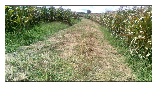
Figure 2. Grassed contour ridge in a protected field in a newly resettled A2 farm (Gambira farm).