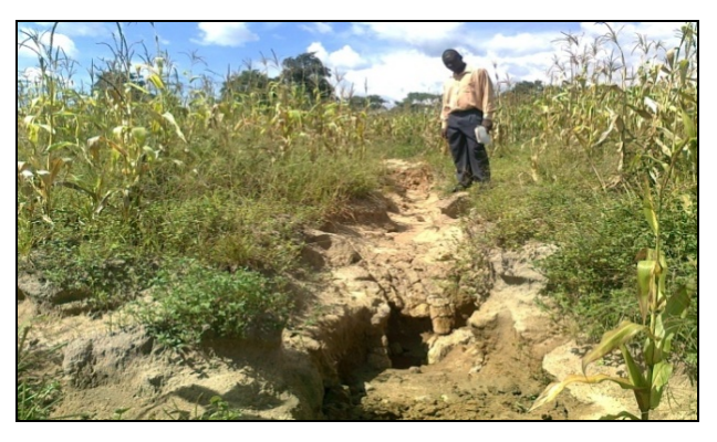
Figure 3. Gully erosion working in an unprotected field in a newly resettled A2 farm in Mutoko District.