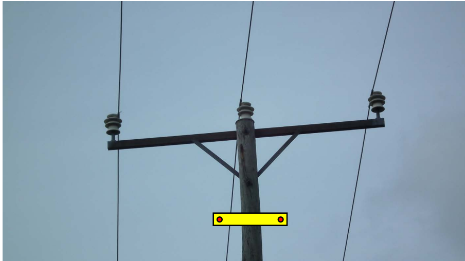
Figure 1. A typical 20 kV transmission line with three current-conducting wires.

locations of the three wires are not restricted in any way. This means that we need to introduce a system of coordinates fixed to the device, relative to which the locations of the wires are specified. An illustration of the device is added to Figure 1 .