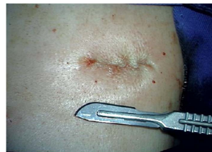
Figure 3. The final result of the minimally invasive technique, paramedian 3 cm incision.