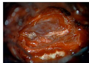
Figure 5. A microscopic view of an intradural, extramedullary mass. Meningioma.