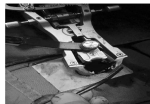
Figure 4. The tubular retractor fixed to the operation table.