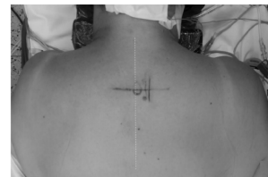
Figure 2. Surgical planning. A 3 cm paramedian incision.