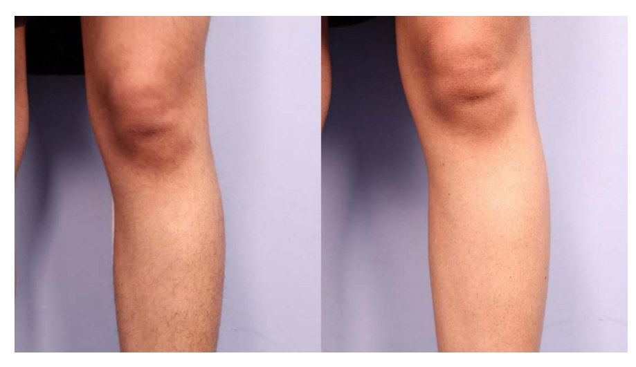
Figure 10. Leg of a dark skin type subject treated with 810/1064 hand piece at baseline (left) and at 6 months after last treatment (right).