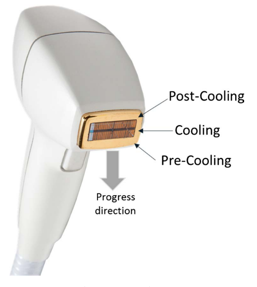
Figure 3. Handpiece tip cooling.

The dimensions of the sapphire light guide are 11 mm \times 27.5 mm.