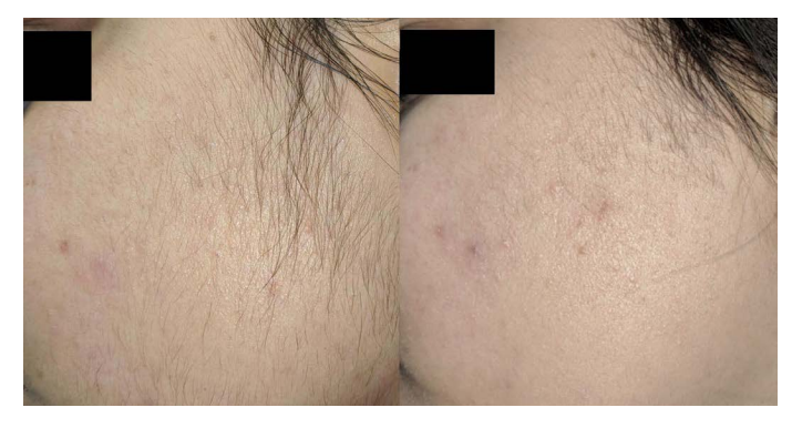
Figure 8. Face of a dark skin type subject treated with 810/1064 handpiece at baseline (left) and at 6 months after last treatment (right).