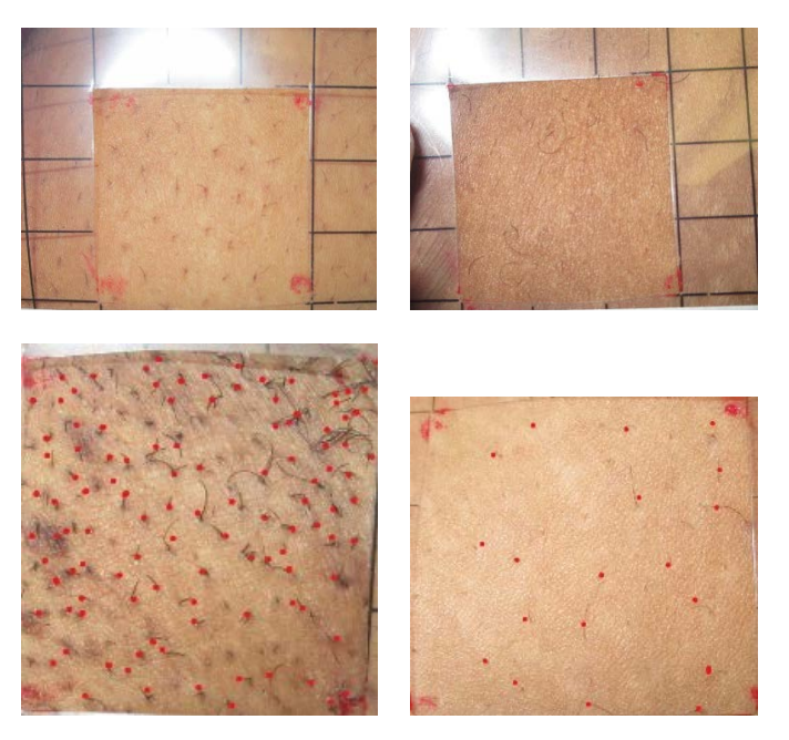
Figure 4. Examples of area marking in bikini (upper) and hair counts in underarm (lower) areas conducted in photos before (left) and at follow-up visit (right).