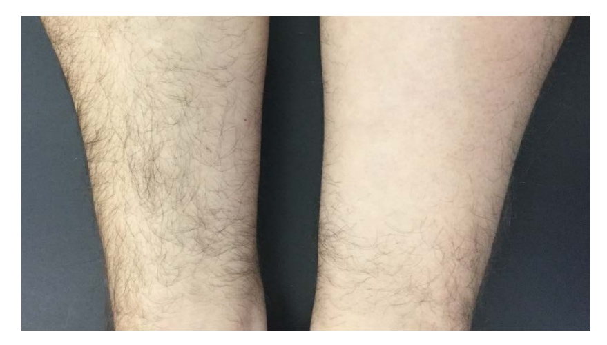
Figure 5. Arm treated with 755/810 handpiece at baseline (left) and at 6 months after last treatment (right).