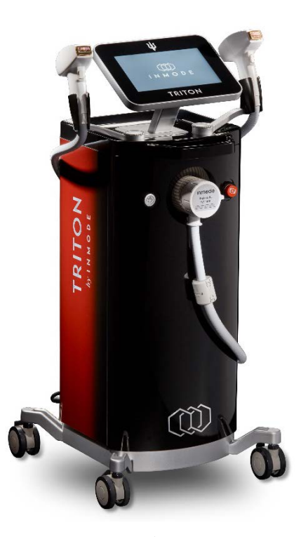
Figure 1. Triton/DiolazeXL Device.

The sapphire light guide is located at the front of the handpiece and delivers the laser beam energy to the treated tissue, while cooling the skin. The sapphire block is surrounded by a chilled gold-plated metal frame. This structure provides increased cooling to a temperature of about 7°C on the treatment spot and a few millimeters around it. The handpiece cooling flow is demonstrated in Figure 3 . The arrow indicates the tip progress direction on the skin. One part of the metal frame is responsible for pre-cooling, the sapphire light guide is responsible for the cooling stage and the other part of the metal frame is responsible for post-cooling during handpiece progression.