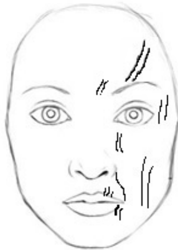
Figure 3. Schematic presentation of sleep lines, which are vertically oriented to the pulling and pushing forces on the face during sleep.