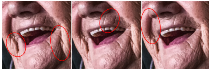
Figure 1. Deep vertical sleep creases around the lips, and nasolabial folds.