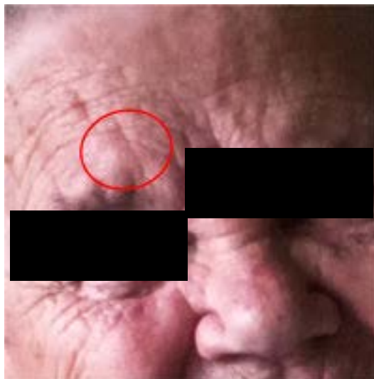
Figure 2. Deep vertical sleep creases around the forehead.