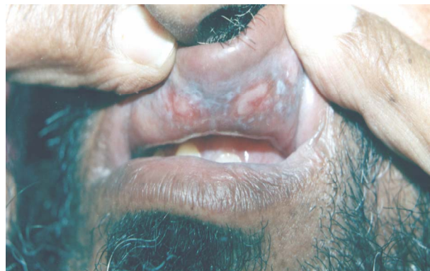
Figure 1. Superficial ulcerations on reticulate hyperpigmented erythematous ill defined surface limited to the inner aspect of upper lip.

to King Faisal Specialist Hospital (KFSH), Riyadh, where he was examined, biopsied and diagnosed as “grade I follicular small cell non Hodgkin lymphoma” according to the final report given to him. Aspirate of bone marrow was positive for malignant cell suggesting the dissemination the disease. This was confirmed by emission tomography scanning which proved positive in submandibular region, sternum, ribs, lumber spine V and sacral I. On another visit in April 2001 there was progression of the disease in the mediastinum. On December 2001 he presented with a new painful swelling on the right scapular region