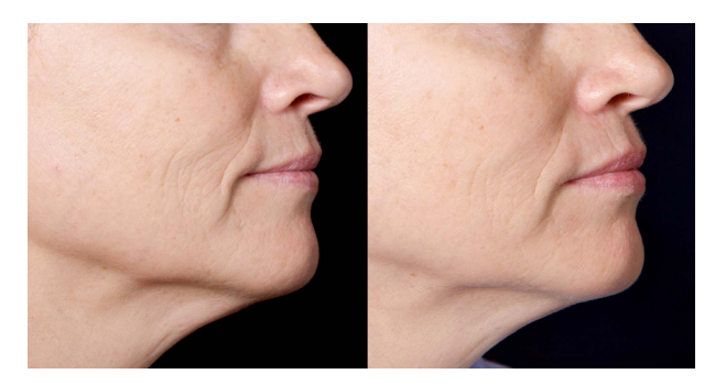
Figure 4. Perioral wrinkling before (left) and after 1 month (right).