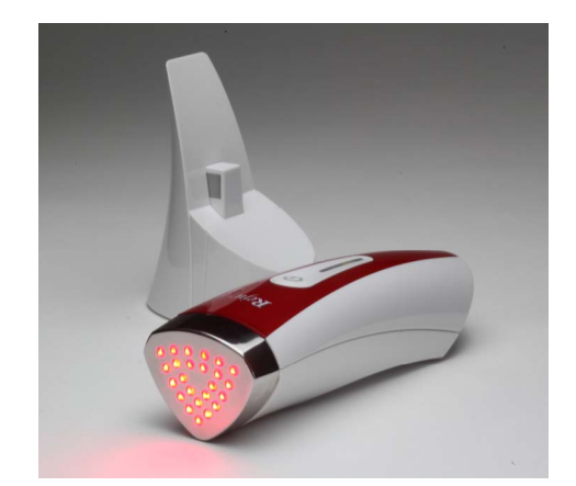
Figure 1. Silk'n Reju/FaceFX facial skin rejuvenation device and charging cradle.

Patients were guided how to use the equipment and treated themselves under the guidance of a qualified person in the study sites clinics. Facial treatment zones were