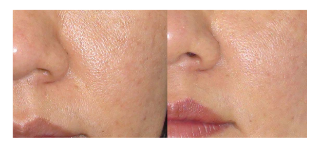
Figure 10. Large pores before (left) and after 2 months.