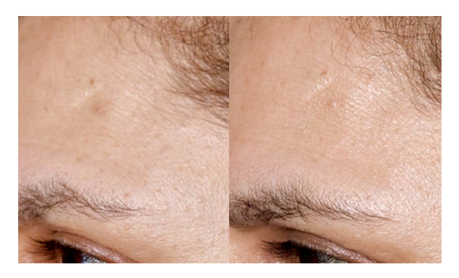
Figure 12. Forehead pigmentation before (left) and after 1 month.

Most patients expressed their degree of satisfaction to the overall improvement of facial skin after 1, 2, and 3 month follow-up sessions, as described in Table 2 . Patients related to skin texture (pores, elasticity and firmness), to fine line and wrinkles and to pigmentation. No one experienced lack of response. Most patients (88% -91%) reported considerable and some response at all 3 points of follow-up.