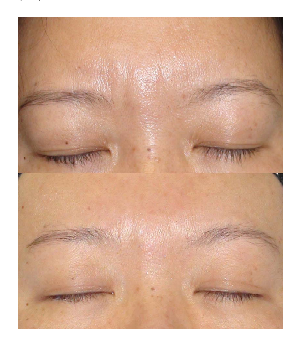
Figure 8. Forehead wrinkling before (top) and after 2 months (bottom).